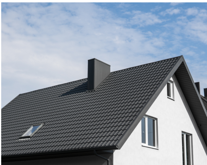
Tedlar® PVF film is available in many colors for roofing or facades.

These critical qualities are warranted upon appropriate adhesion of Tedlar® PVF film independently of the substrate and the application process. This represents a distinct advantage compared to paint, which requires careful control of the substrate preparation, the application process and the paint formulation and storage conditions.