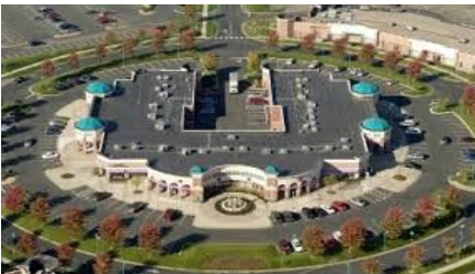
Tamarack Village, 2017