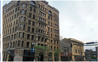
Hennepin Theater Trust, 2019