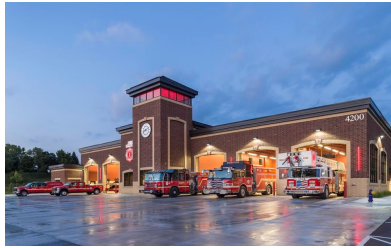
Eagan Fire Station, 2018