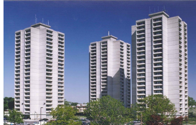
Horn Towers, MN Public Housing, 2018