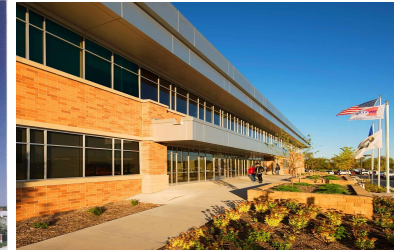
Flint Hills Utility Offices, 2017